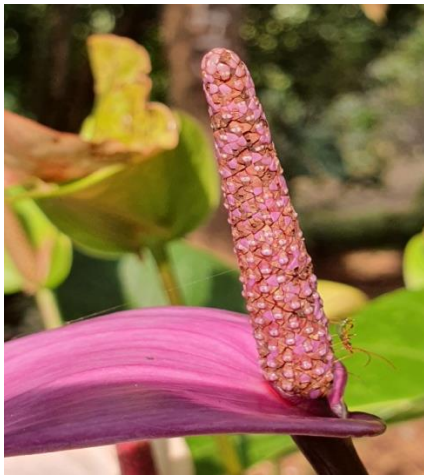
Infested spadix with H. theivora nymph