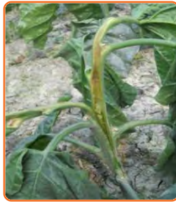
Hollow stalk disease