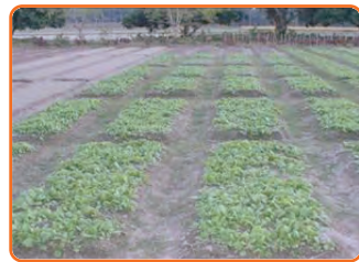
Nursery bed of tobacco