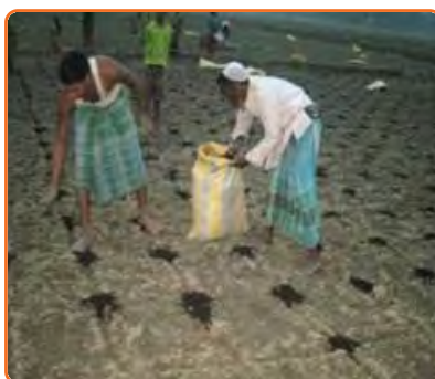
Pouch application of FYM and SSP