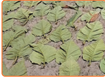
Spreading of tobacco leaves on ground