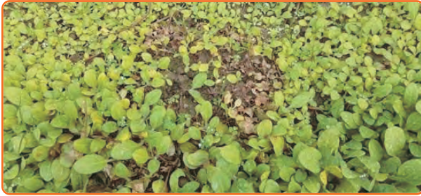
Damping-off disease in nursery