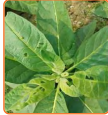
Leaf eating caterpillar