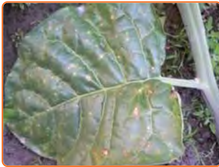
Brown spot disease