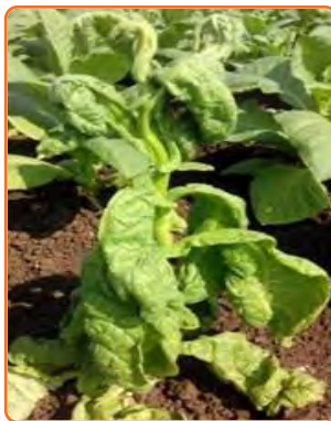
Leaf curl disease