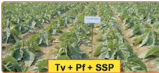
Biocidal treatment of tobacco field