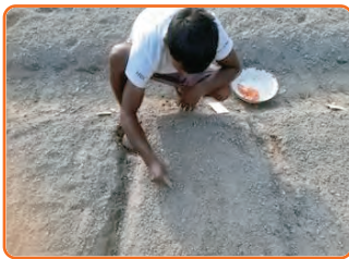
Sowing of tobacco seed