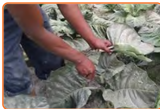
Harvesting of tobacco leaves