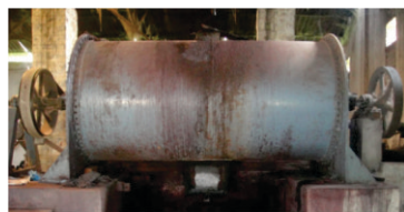
Fig. 6 Washing machine