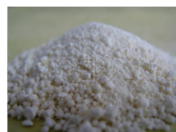
Fig. 18 Bleached lac (powder)