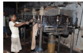
Fig. 16 Steam heated hydraulic press