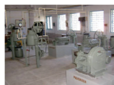
Fig. 22 Aleuritic acid Pilot plant