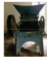
Fig. 5 Lac crusher