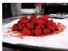
Fig. 23 Lac dye