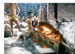
Fig. 12 Charcoal fired bhatta