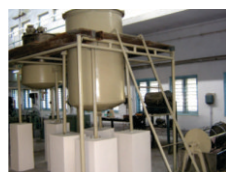
Fig. 19 Bleached lac Pilot plant