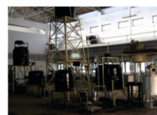
Fig. 24 Lac dye Pilot plant