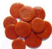
Fig. 15 Button lac