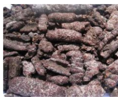
Fig. 3 Sticklac