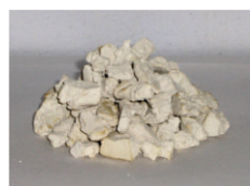
Fig. 20 Aleuritic acid (Technical)