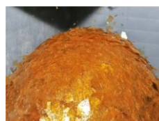
Fig. 11 Machine made shellac