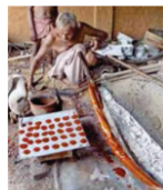
Fig. 14 Button lac manufacturing