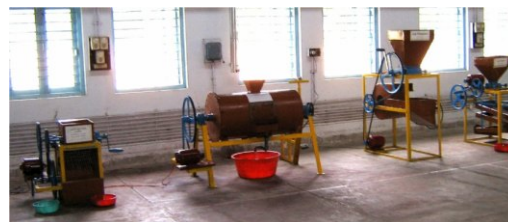
Fig. 8 Small scale lac processing unit