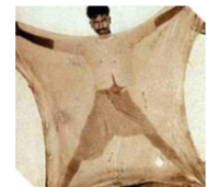
Fig. 13 Making of hand made shellac