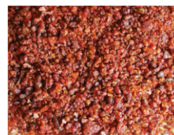
Fig. 4 Seedlac