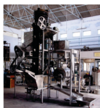
Fig. 9 Integrated Small scale lac processing unit