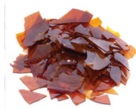
Fig. 10 Hand made shellac