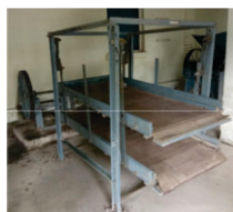
Fig. 7 Lac grader