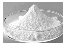
Fig. 21 Aleuritic acid (Pure)