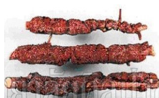
Fig. 2 Lac stick