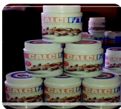
Calcium extracted from Tuna bone