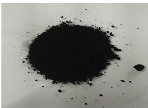
Melanin from cuttlefish ink