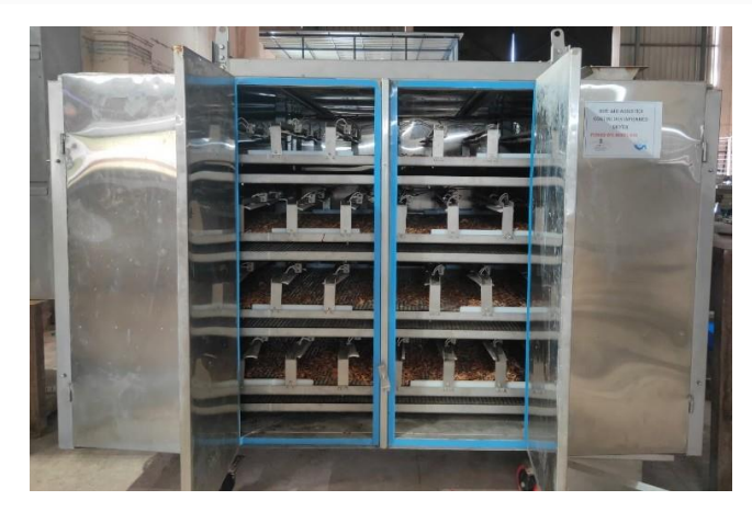
Fig. 10. Pilot-scale hot air-assisted continuous infrared dryer

provided using a PLC (Siemens LOGO X50) and HMI (Siemens LOGO TDI) for situations where full power is not required. Switching on and off the IR heaters of each layer was also controlled by the PLC and HMI automatically. The drying chamber has six air inlets (d = 0.20 m) and two exhaust (rectangular mesh opening) ducts for hot air circulation and to remove humid air. A temperature sensor (J-type thermocouple) was fixed inside the chamber to measure the air temperature during drying. A discharge chute was placed to collect the dried samples.