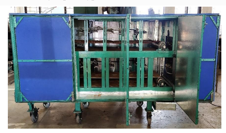
Fig. 9. Hot air assisted infrared dryer prototype