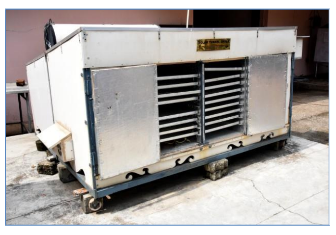
Fig. 4. ICAR-CIFT Solar-electrical hybrid dryer

The dryer consists of four drying chambers with nine trays in each chamber (Fig. 4). The trays made of food-grade stainless steel are stacked one over the other with a spacing of 10 cm. The perforated trays accomplish a through-flow drying pattern within the dryer which enhances drying rates. Solar flat plate collectors with an area of 7 m<sup>2</sup> transmit solar energy to the air flowing through the collector which is then directed to the drying chamber. The capacity of the dryer is 40 kg. Electrical backup comes into a role once the desired temperature is not attained for the drying process, particularly during rainy or cloudy days.