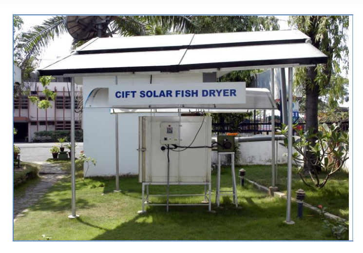
Fig. 3. ICAR-CIFT Solar-electrical hybrid dryer

ICAR-CIFT designed and developed a novel system for drying fish using solar energy supported by environment-friendly LPG backup (Fig. 2). In this dryer during sunny days fish will be dried using solar energy and when solar radiation is not sufficient during cloudy/ rainy days, LPG backup heating system will be automatically actuated to supplement the heat requirement. Water is heated with the help of solar vacuum tube collectors installed on the roof of the dryer and circulated through heat exchangers placed in the PUF-insulated stainless steel drying chamber. Thus, continuous drying is possible in this system without spoilage of the highly perishable commodity to obtain a good quality dried product.