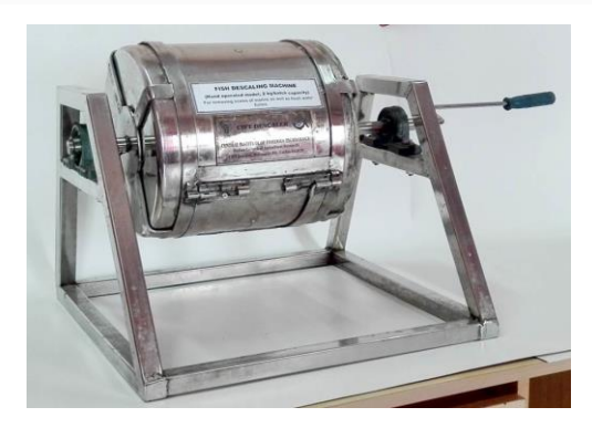
Fig. 11. Hand operated fish descaling machine

cylinder during the rotation of drum removes the scale. Leak proof door with lock is provided for loading and unloading purposes. A hand pedal is fitted on the side to rotate the drum manually.