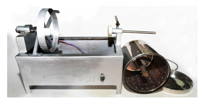
Fig. 14. Mini fish descaling machine