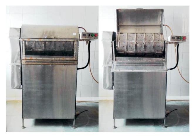
Fig. 13. Variable speed fish descaling machine

To cater the household needs related to fish descaling, a motorized version of 1 kg capacity fish descaling machine was developed at ICAR-CIFT. It can be used in home kitchens and hotels for easy removal of fish scales. The equipment consists of a rotating drum, nylon brush, motor and frame to support the assembly. The diameter and length of the drum are 190 mm and 225 mm respectively. Inside of the drum is riveted with perforated stainless-steel mesh. The fish can be fed to the drum and motor switched on for descaling action. The machine can be loaded with 1 kg of fish in single batch for effective removal of scales. Cleaning of the machine can be done easily by detaching the drum with perforations inside. The system is ergonomically designed in such a way that even women can work on it without any drudgery. The drum speed of descaling machine is optimized with respect to the efficiency level and it was found that maximum efficiency can be attained at 22 rpm drum speed at the loading capacity of 1 kg of fish. Descaling of Sardine and Tilapia required 5 minutes to attain efficiencies of 84.60% and 79.59% respectively.