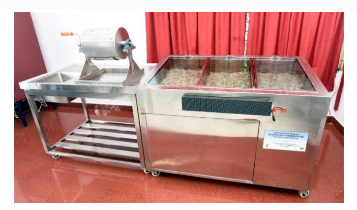
Fig. 15. Refrigerated mobile fish vending Kiosk

Exposure of fishes to the atmosphere often leads to contamination by means of dust, insects and flies apart from deterioration of quality in terms of freshness and taste. ICAR-CIFT, Cochin, has designed and developed a low-cost energy efficient refrigerated hygienic mobile fish vending kiosk to sell fish at consumer's door step under hygienic conditions in village/urban/municipality areas with proper waste disposal system. The unit was fabricated mainly using food grade material stainless-steel (SS 304) with transparent poly carbonate/toughened glass sheets for the display. The kiosk can carry 20-30 kg fish under refrigerated storage. It was designed considering the maximum weight that a man pulls on a rickshaw. The main components of the kiosk model are chilled fish storage cum display unit with three chambers, a hand operated descaling machine (3 kg) and fish dressing deck with wash basin, water tank, cutting tool, waste collection chamber and working space. The main feature of the prototype is that consumer can see the fishes directly through transparent cover and select according to their choice of purchase. A digital sign board is attached in the front of kiosk to display the available fishes and their rates.