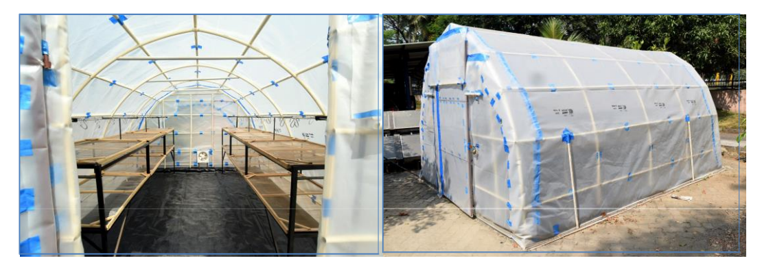
Fig. 5. ICAR-CIFT Solar-tunnel dryer

ICAR-CIFT developed a low-cost, energy-efficient solar tunnel dryer for bulk drying fish and fishery products. This dryer can be used by fishermen or small-scale fish processing units for bulk drying during seasonal higher catch/excess landing of fish. The capacity of the solar -