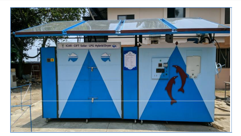
Fig.2. ICAR-CIFT Solar-LPG hybrid dryer

The solar dryer is ideal for drying fish, fruits, vegetables, spices, and agricultural products. It helps to dry the products faster than open drying in the sun, by keeping the physicochemical qualities like color, taste, and aroma of the dried food intact and with higher conservation of nutritional value. A programmable logical controller (PLC) system can be incorporated for automatic control of temperature, humidity, and drying time. Solar drying reduces fuel consumption and can have a significant impact on energy conservation.