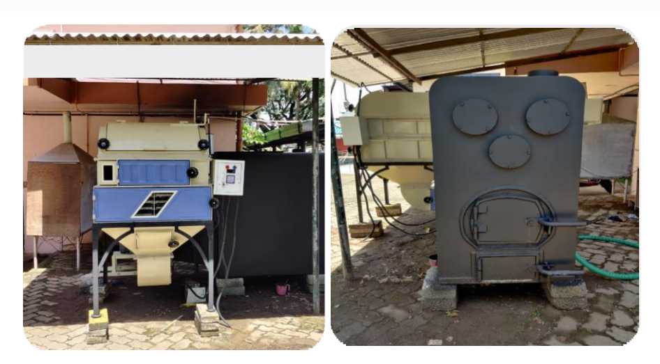
Fig. 6. ICAR-CIFT Biomass dryer

Biomass dryer consists of drying chamber, blower, biomass furnace and a hot air recirculatory system (Fig. 6). The capacity of this dryer is 30-40 kg with 10 trays. Biomass furnace capacity is 25 kg (wood) with the dimension 0.77 m x 1.76 m x 1.42 m. Biomass dryer is provided with a blower of 0.5 hp and axial fan of 0.25 hp. This dryer is suitable for drying fruits, vegetables, spices, condiments and fish. Biomass dryer is highly economical to operate where the biomass availability is abundant and free of cost.