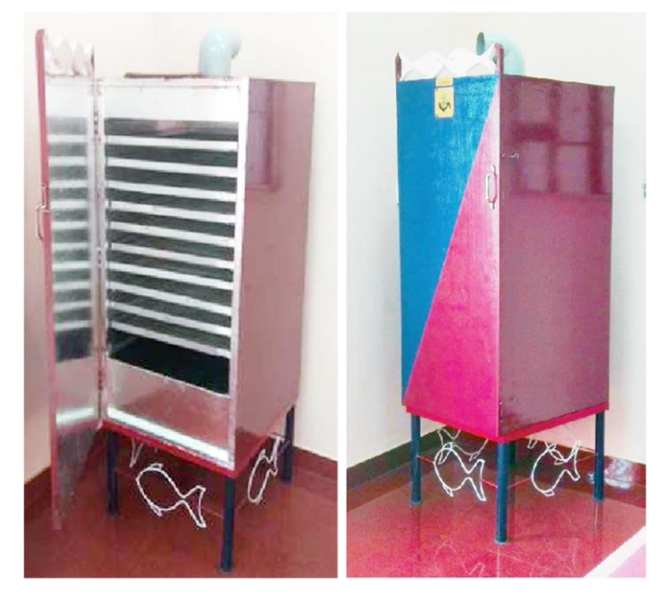
Fig.7. Household Electrical dryer

This dryer is suitable for drying agricultural commodities. The cost of electrical dryer is low, but the operational costs is high due to the sole electricity consumption.