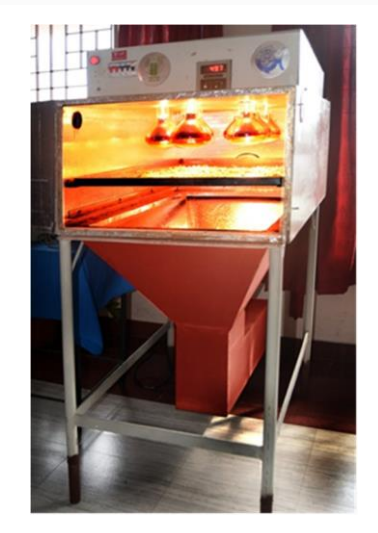
Fig. 8. Batch type Infrared dryer

Advantages of using IR for drying include flexibility of operation, simplicity of the equipment, fast response of heating and drying, easy installation to any drying chamber, and low capital cost (Sandu, 1986). It can be used for various food materials like grains, flour, vegetables, biscuits, pasta, meat, and fish. A simple IR dryer consists of an inlet and outlet hopper, manual conveyor system, IR lamp arrangements, voltage regulator, and timer relay. Food product enters from the inlet hopper to the manual conveyor and it moves parallel to the IR lamps and dried. The IR radiation intensity can be adjusted via the voltage regulator and intermittent IR drying can be implemented by a timer relay.