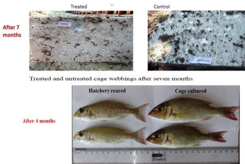
Fig 2. Control and treated net after 7 months exposure in the marine environments.

To study the biofouling resistance of the treated net can be evaluated by different methods. The field evaluation of the cage net showed the excellent biofouling resistance after 90 days exposure in the estuarine environment. The experiment was repeated by constructing a cage with treated and control panels and exposed in the Vizhinjam coast for 7 months (fig 1). The fishes grown in the cages and controlled environments were compared and exhibited significant difference in growth was shown.