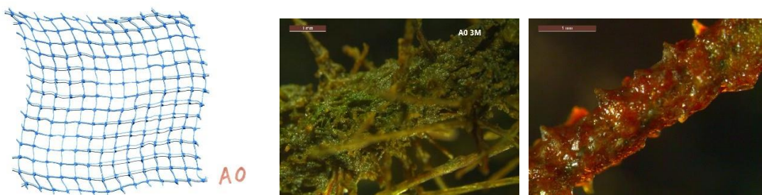
Fig 1. A) PE cage net b) PE cagenet after 3 months c) PE cagenet treated with PANI+nano CuO after three months exposure in the estuary.