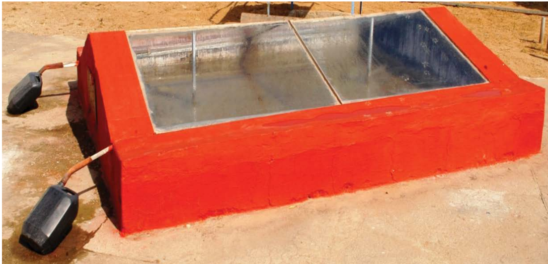
Fig. 2. Solar desalination devices made of brick-cement plastered material.