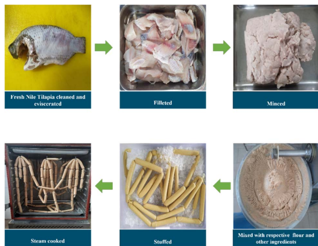
Fig. 1 Process flow of tilapia sausage preparation.