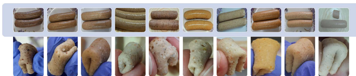
Fig. 2 Folding test results of the 9 millet included sausages (starting from left– FM, FTM, LM, KM, PM, PRM, BM, BTM, and sorghum), and control sausage (extreme right).

The overall practical implications of the present study could be projected in a larger perspective as briefed here. The sustainable development goal 2 is 'to end hunger, achieve food security and improve the nutrition and promote sustainable