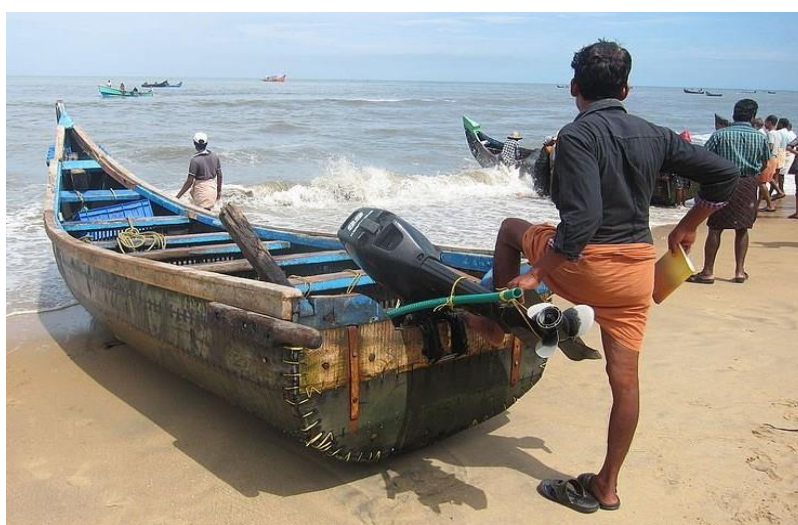
Fig.5 Outboard motor fitted vessel for marine fishing.

Motorized vessels: Motor is used for the propulsion of these vessels. Fig.5 shows motorized fishing boat used in marine fishing. 2 hp to 65 hp inboard and outboard engines are used here.