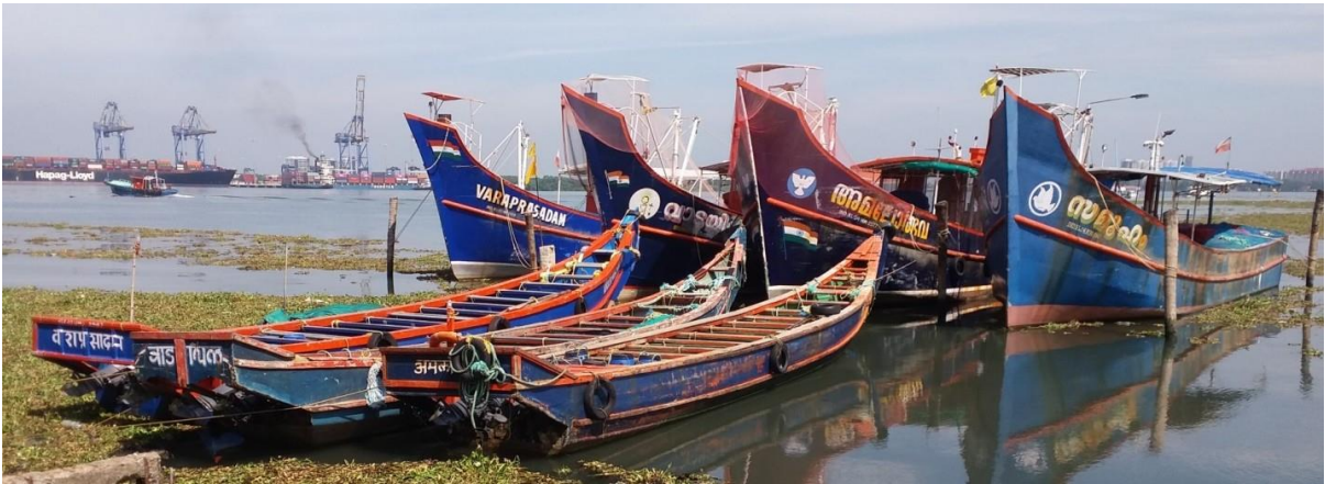
Fig.7- Small boats are OBM fitted and large one has IBM.