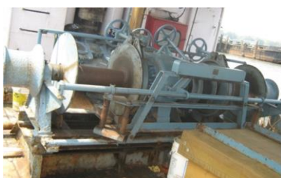
Fig.6 Commercial Trawler, otter boards seen hanging on the gallows and winch in the last Fig. Seiner

These vessels use surrounding seine nets. They comprise a large group ranging from open boats and canoes up to large ocean going vessels. They are used to catch pelagic species. Relatively high maneuverability is required for operation of the surrounding and seine nets.