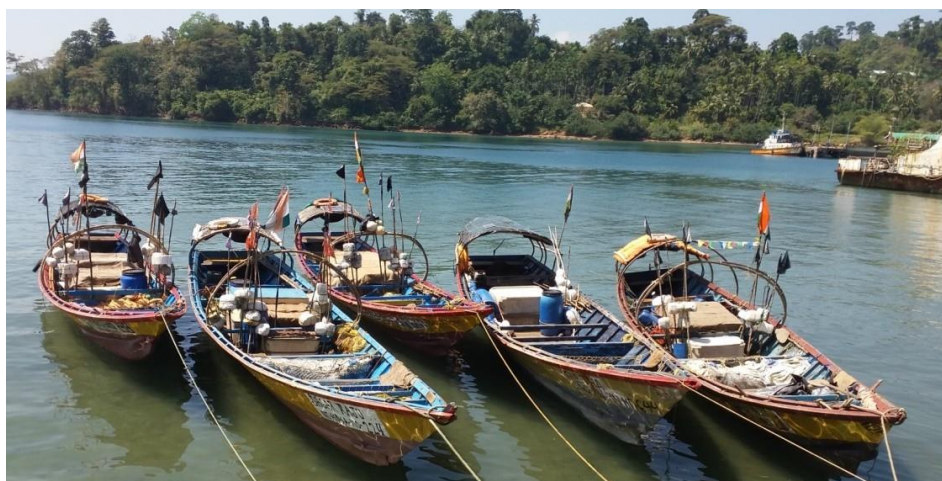
Fig.4 Traditional fishing boat - Andamans

Traditional fishing vessels: These are vessels using traditional methods for fishing. There is no deck equipment such as winch. No insulated/cold storage is available onboard. No wheel house and accommodation is provided in these vessels. In general simple traditional fishing carried out from these vessels.