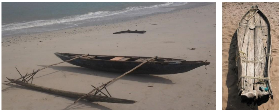
Fig.2 & 3 Artisanal fishing vessel-Nicobar & Wooden Cattamaran