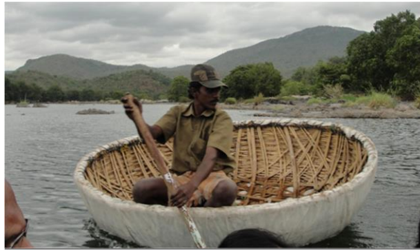
Fig.1 Artisanal coracle-reservoir/ river fishing

Artisanal fishing vessels : Small-scale, low-technology, low-capital, low- energy, relatively small fishing vessels, making short fishing trips, close to shore by individual fishers of coastal or island ethnic fishers and mainly for local consumption. In practice, definition varies between countries- India wooden dugout canoes, coracles and catamaran are artisanal crafts.