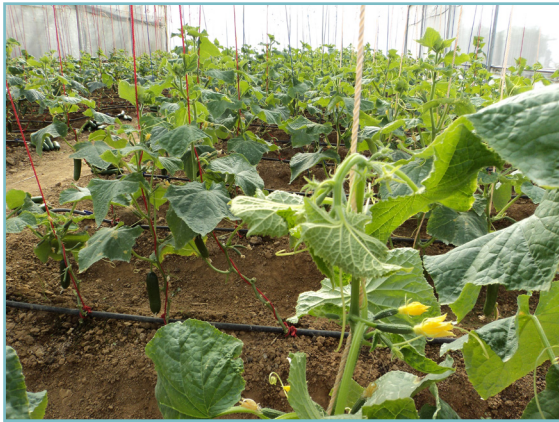
Plate 2.1. Cucumber (Palampur)

yield in spongegourd and summer squash, respectively.