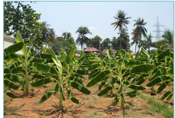
Plate 2.4. Banana (Chalakudy)