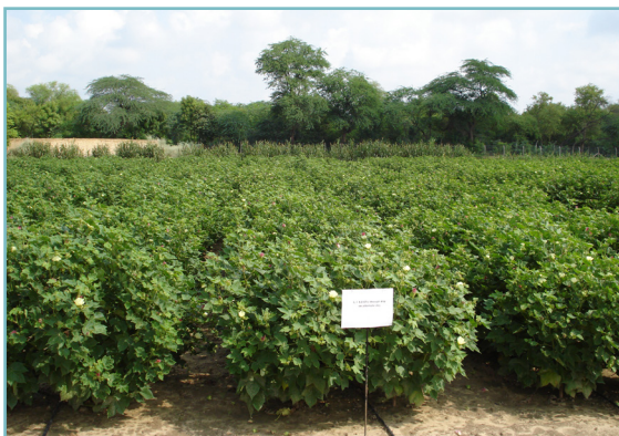
Plate 2.5. Cotton (Sriganganagar)