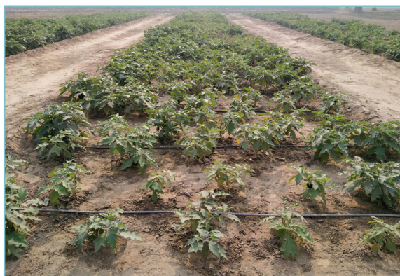
Plate 3.2: Brinjal (Bathinda)