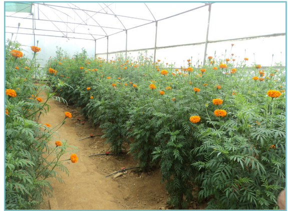
Plate 2.2. Marigold (Palampur)