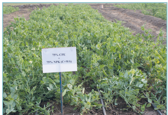
Plate 2.6. Peas (Pantnagar)