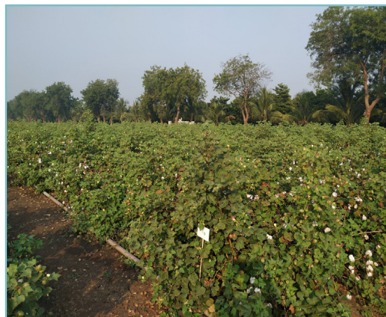
Plate 3.6: Cotton (Junagadh)