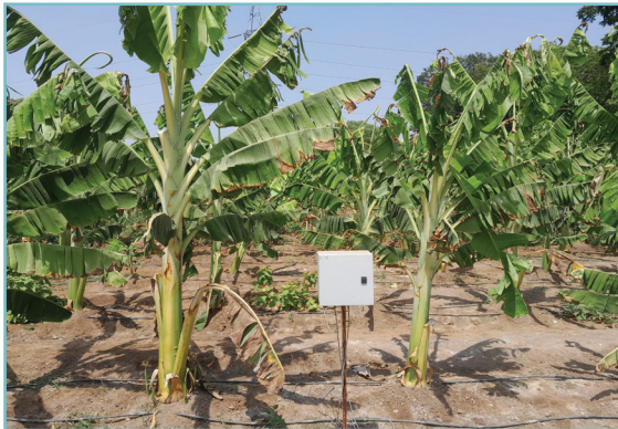
Plate 2.3. Banana (Bhavanisagar)