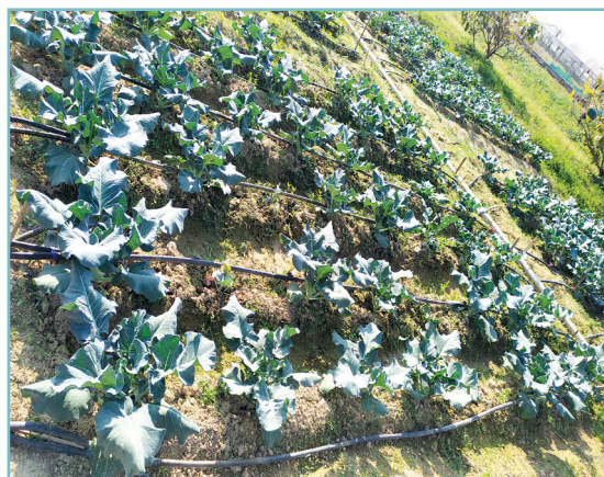
Plate 3.3: Broccoli crop (Palampur)