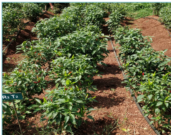
Plate 3.5: Chilli (Chalakydy)