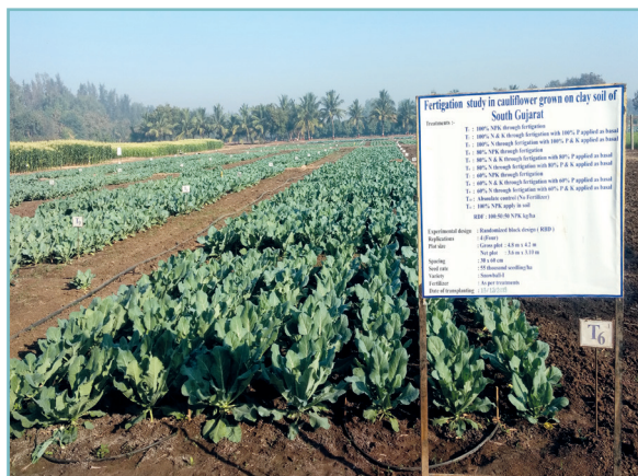
Plate 3.4: Cauliflower crop (Navsari)