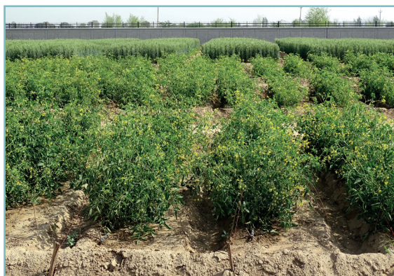
Plate 3.1: Tomato crop (Bathinda)

3.6 Madurai: At Madurai on sandy clay soil, the treatment with 25% NPK as basal and 75% NPK through fertigation had significantly higher chilli and brinjal yields followed by 75% NPK fertigation treatment, both also being statistically at par with each other. The minimum yield was obtained with conventional NPK application followed by 75% and 100% N fertigation. The B:C ratio was higher with 25% NPK as basal and 75% NPK through fertigation primarily due to higher chilli and brinjal yields and minimum was obtained with 100% NPK conventional method.