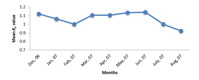
FIGURE 2 Monthly mean variations of pooled relative condition factor (K_n)

sent study the K_n value found to be higher in smaller size fishes which might be due to relatively more growth and it is in agreement with the earlier workers (Das 2004; Pramanick et al. 2017)). Condition factor in fishes generally influenced by several factors like food abundance and physicochemical characters of the environment (Ranganathan and Natarajan 1970), age and sex of fish (Everhart et al. 1975), spawning (De Silva and Silva 1979), sex and maturity (Gowda et al. 1987), environmental condition, breeding, feeding (Dhanze and Dhanze 1997) and pollution (Sandhya and Shameem 2003; Rao et al. 2005).