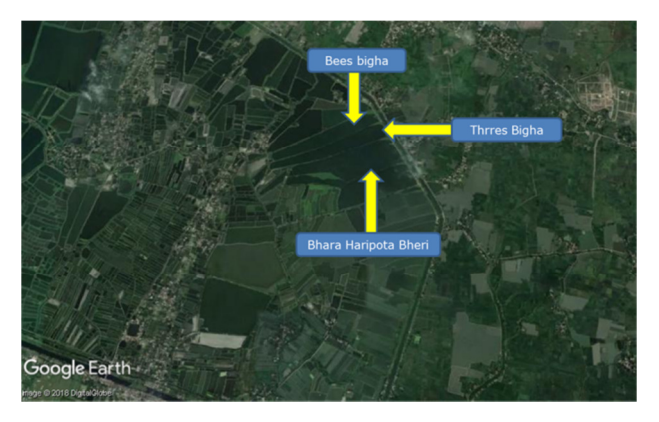
FIGURE 1 Study area of wetlands of South 24 Parganas district of West Bengal

The sample constituted 275 specimens of L. calbasu with size ranged from 130 to 430 mm in total length collected from various wetlands (Bhara Haripota Bheri, Trees Bigha and Bees Bigha) of South 24 Parganas district of West Bengal during the period of investigation of nine months from December 2006 to August 2007 (Figure 1). About 30 specimens were collected each month during morning hours (0600 – 0700 hours) from wetlands. The specimens were caught by cast net (mesh 25–30 mm) and drag net (mesh 5–30 mm). The specimens were brought to the laboratory of Department of Fisheries Resource Management, Faculty of Fishery Sciences, WBUAFS, Chakgaria, Kolkata, West Bengal.