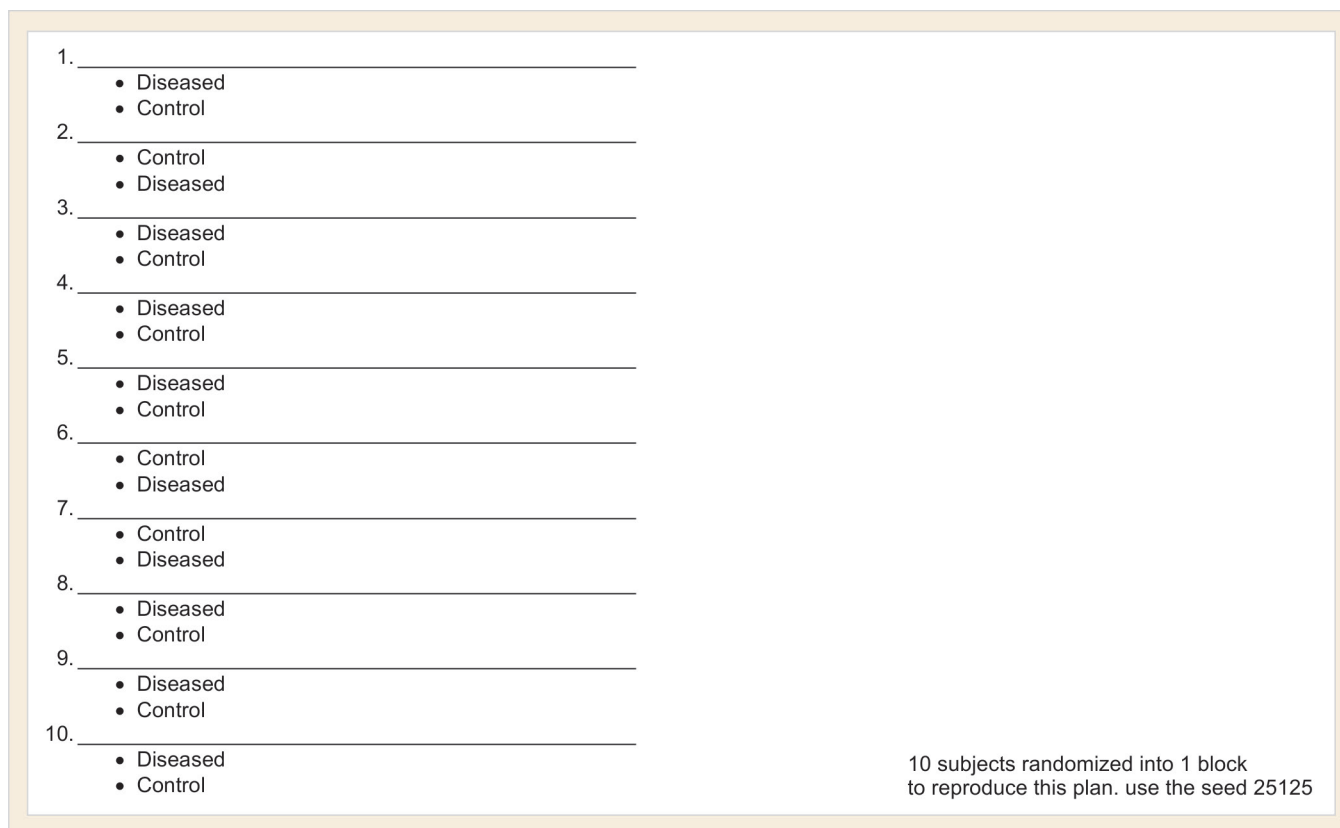
Fig. 2: Output of online software with seed for 10 subjects randomized into two groups in single block randomization; www.randomization.com